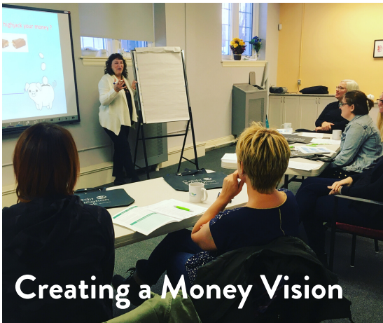
Creating a Money Vision

‘Household debt is 177% of disposable income..... households are using a record 14.9% of their spending money to meet debt obligations’, Global News, Sept 13, 2019.